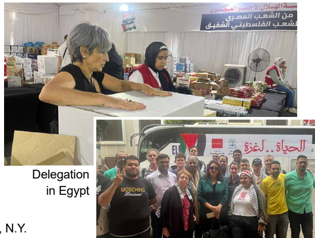
Delegation in Egypt

A delegation comprised of representatives of anti-war and solidarity organizations, including the